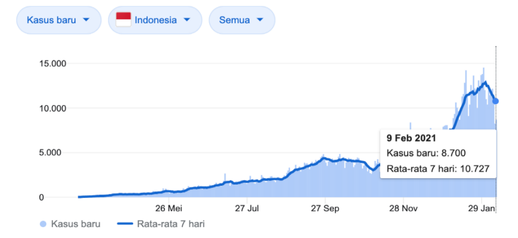
Graph 1. Data concerning COVID-19 Cases in Indonesia as of 9 February 2021

Source: COVID-19 Handling Task Force (Covid-19, 2021)