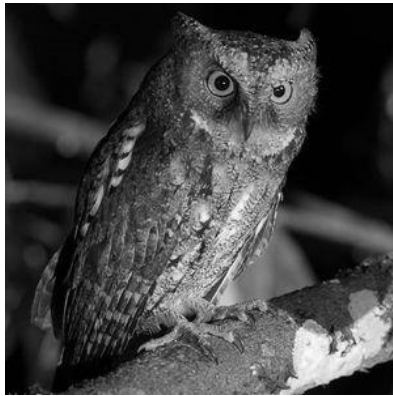
Manguni Bird ( Sulawesi Scops Owl, Otus Manadensis - Petit-Duc de Manado, 2016)