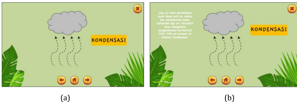
Figure 3. Product Before (a) and After Revision (b) in Material Validation

Second, material experts are validated by filling out an assessment questionnaire sheet that material experts have developed. Based on the results of material validation on PowerPoint learning media, the Learning aspect obtained a percentage of 95.55%, and the Content aspect obtained a percentage of 96.36%. The average result of material validation on Powerpoint learning media obtained a percentage of 96% with a very feasible category so that teaching materials can be used.