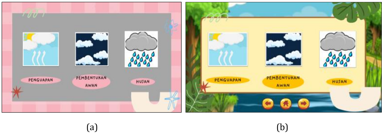
Figure 2. Product Before (a) and After Revision (b) in Media Validation

After the validator has finished filling out the questionnaire and giving scores on each instrument, the validator provides comments and suggestions for researchers to revise the initial product design.