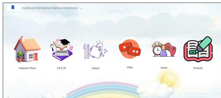
Figure 3. Media Display

Second, the researcher designed a media framework by paying attention to the curriculum and characteristics of the students. The design includes several elements, such as the Home Page as a starting point, CP & TP to set learning objectives, and an interactively presented Materials section. In addition, this media also utilizes videos to clarify concepts, games to add elements of motivation and exercise, and Evaluation to measure student understanding through gamification-based quizzes and assessments. All of these elements are designed to create an engaging, interactive, and effective learning experience.