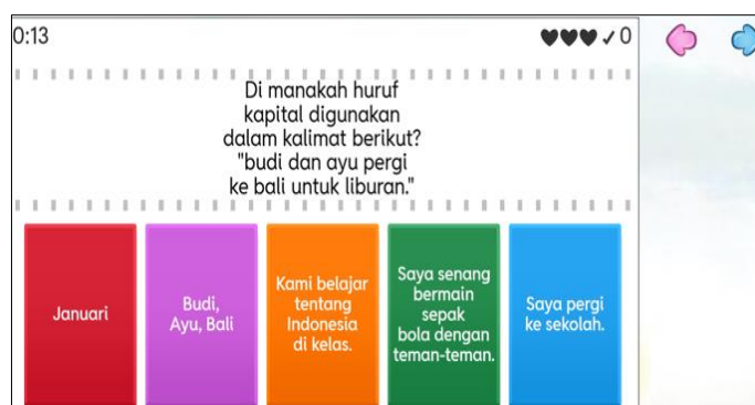
Figure 7. Game menu display

When the Game menu is clicked, it will display interactive questions. In this image, students are asked to choose the correct sentence from several available options. Each choice is answered by choosing one of the colored blocks. If the student chooses the wrong answer, the love in the upper right corner will decrease, indicating a decrease in points or progress. This provides competitive elements and challenges that can increase students' motivation to continue learning and try to answer correctly.