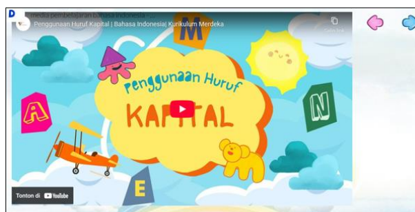
Figure 6. Video Views

Next, on the Video menu, a video taken from YouTube will appear, which discusses the use of capital letters.