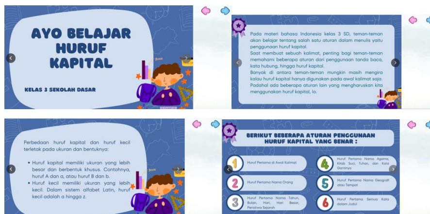
Figure 5. Material menu display

sentences, for people's names, geography, and in titles. This explanation is presented in a simple and easy-to-understand way for students.