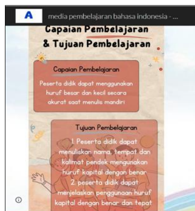
Figure 4. CP & TP menu display

In the menu, CP & TP shows Learning Outcomes that require students to use capital letters correctly when writing, as well as Learning Objectives which include the ability of students to write names, places, and sentences with proper capital letters, as well as explain their use according to the rules.