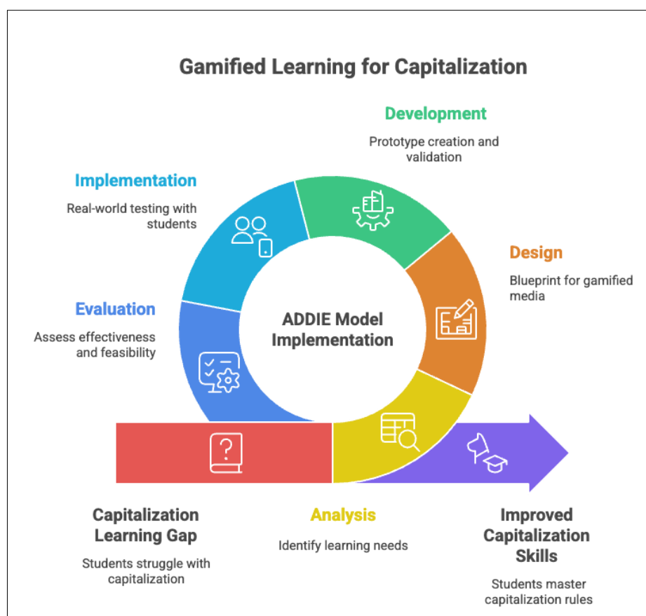
Figure 1. ADDIE

The subject of this research is a third grade student of MI Nurul Huda Temayang who was selected using purposive sampling, where the selection of subjects is based on the fact that at this stage students begin to learn the basic concepts of writing in more depth. The sample consisted of 30 students who were in the experimental group in this study.